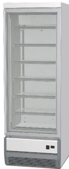
1 door model SRL-CD2075HKC